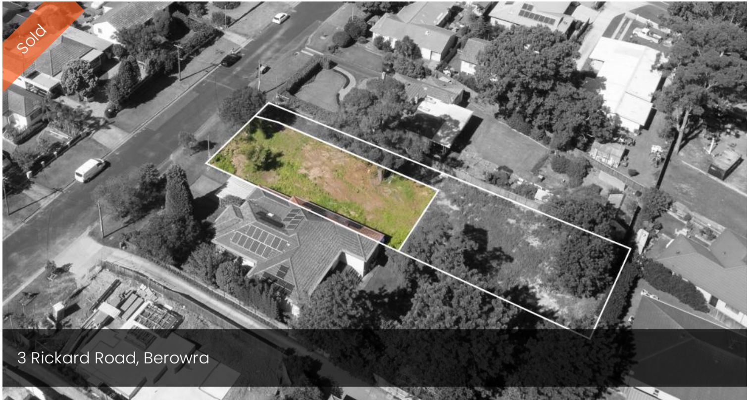
3 Rickard Road, Berowra